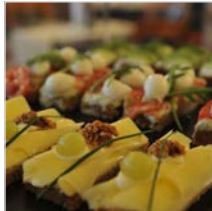
Delicious snack sandwiches