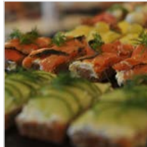
Delicious snack sandwiches