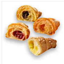
Croissants, various fillings