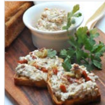
Delicious snack sandwiches