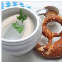
White sausages with a pretzel