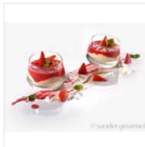
Schuhbeck's dessert in a glass